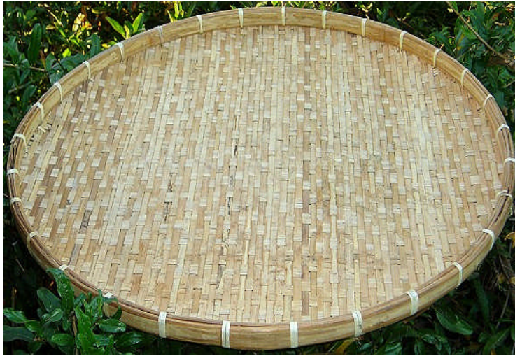
Vaab (Rice Separator)