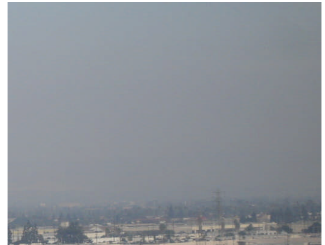
Ab oo (Smog)