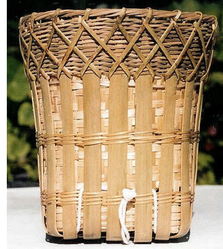
Kawm (Back Basket)