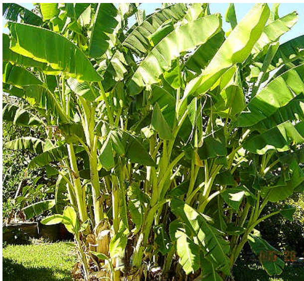
Tsawb (Banana Tree)