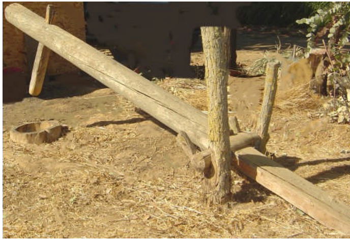
Cug (Foot Rice Grinder)