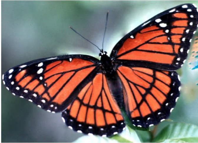
Npauj npaim (Butterfly)